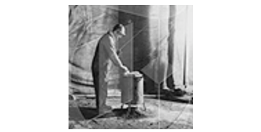
Photo: Preparing a meal at the site of the new CBS Building, 1964.